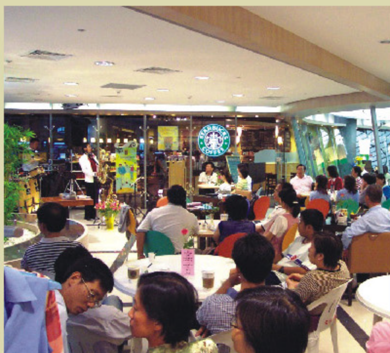
> Live Concert of the Spring Music Festival (May 17)