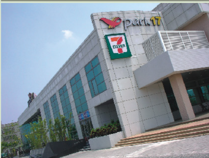
> Park17 Shopping Mall

The STSP aims to make it more life-friendly. In order to provide full range of services, including accommodation, food, educational training and conferences facilities, for the STSP employees and businessmen, the STSP plans to build a STSP business hotel in the southwest of the Administrative Service Zone via BOT, which is the first one ever in Science Parks in Taiwan. After the open bidder, the Ambassador Hotel was then publicly selected on December 23 of 2004 to be the first hotel coming into the Science Park.