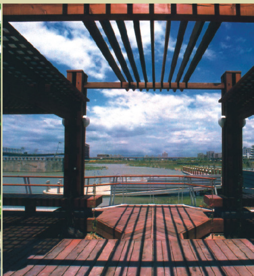
> Siake Lake