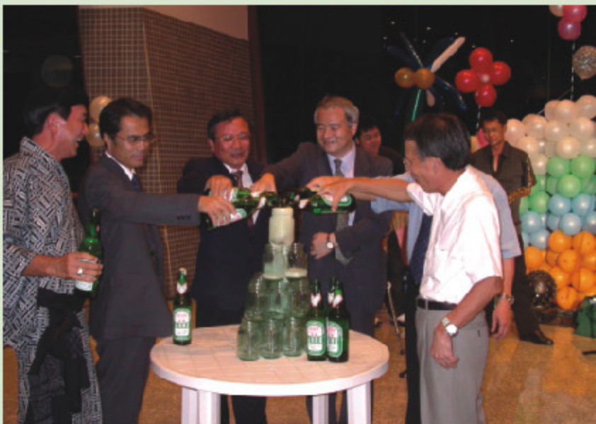
> Beer Festival Held by the Exchange Association for Japanese Enterprises Employees (August 27)