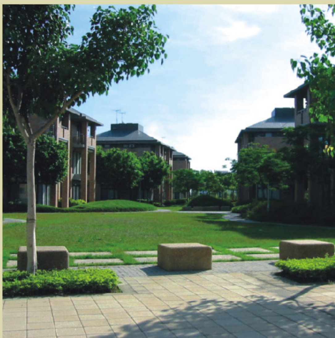
> Phase I VIP Dormitory

Since March 2004, the water parks with leisure green corridors, pedestrian paths, landscape pavilions and curved bridges were completed one after another, such as the Siraya Plaza, Siake Lake, Taoye Lake, and Yingsi Lake. The Siraya Plaza accommodates several performance venues for performances and exhibitions of various scales and nature. The Administration worked with the STSP Enterprises to hold the STSP Beer Festival, Outdoor Movies and Concerts in August, October, and November of 2004. The performance venues, also open for the public to host any cultural activities, are where the STSP employees and local residents can go to spend their leisure time. Since December 1, 2004, the Administration also prepares fishing permits for people to apply in order to fish at the landscape lakes. The STSP employees can also enjoy fishing in the Park.