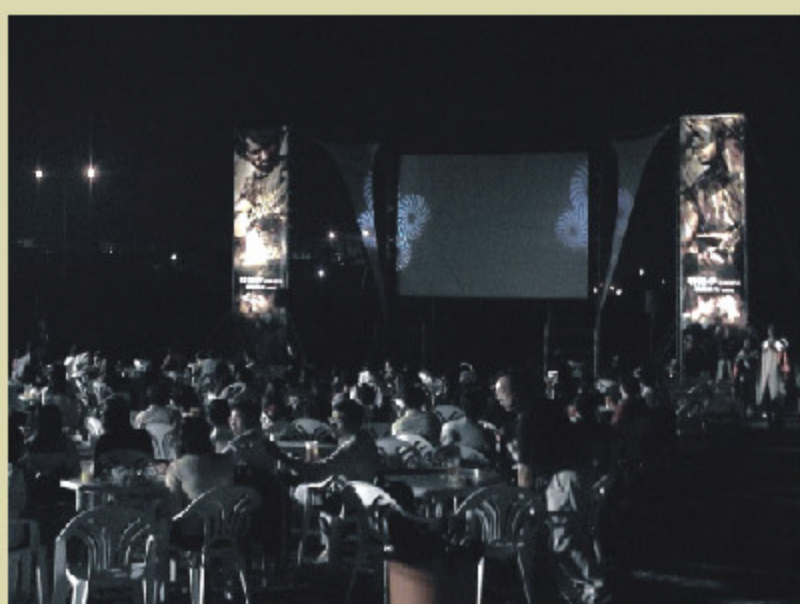
> Movie Next to the Lake - Troy (October 28)