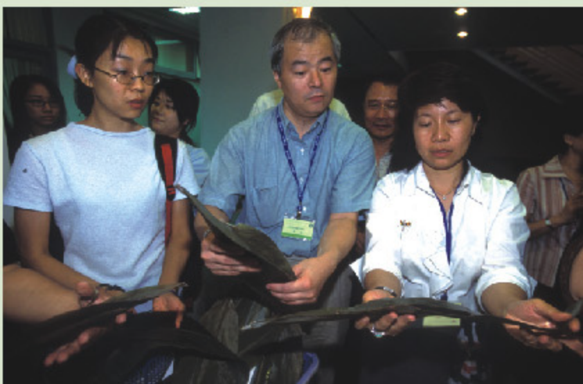
> Glutinous Rice Dumpling Wrapping by the Japanese Employees on the Dragon Boat Festival (June 19)