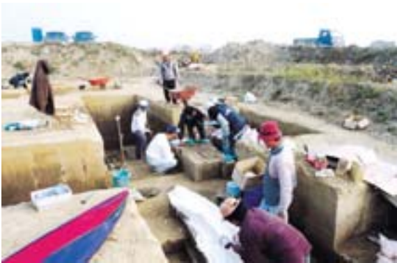
Figure 2-11 Preservation of Historical Relics

The process of preserving historical sites offers academic institutions an opportunity to undertake field work. In September 2002 the results of their work were placed in the Gallery of Archeology for permanent exhibition.