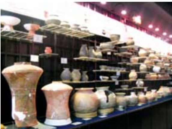
Figure 2-12 Historical Relics on Display

Historical sites unearthed up to the end of 2002