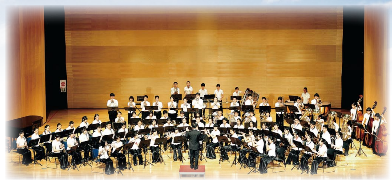
Continuous Outstanding Performance of the Concert Band of the Junior High Department (March 7, 2014)