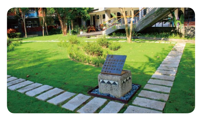
■ The Ecology Learning Trail and Poem Signs in the Bush Garden

Under the Green Project, the NNKIEH realized its goal of building the green campus. The PV system installed on the top of campus buildings improved the issue of high temperature and at the same time generates the electricity up to 39.5kW. The circulation system of the ecological tank at the Junior High Department introduced the underground water source, and with the installation of the filter system, the vigorous eco-system was developed. The ecological learning corridor of shrub garden was remodeled among Building A, B, and C at the Junior High Department. There inside were plants such as China Rose, Blackberry Lilly, Common Crapemyrtle Flower and Rose Moss, with a marble trail. Signs written with Chinese poems of the Tang and Sung Dynasties were also installed.