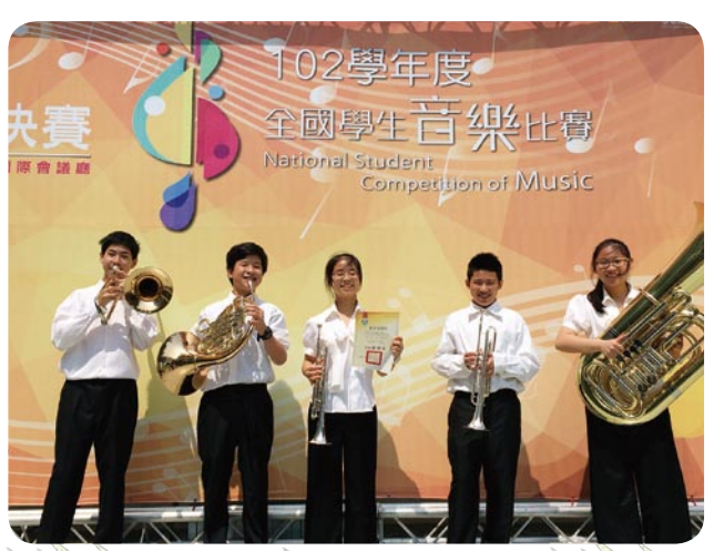
The First Place of Group B of Brass Quintet in "National" Student Music Contest Awarded to the Junior High Department (March 7, 2014)

For scientific education, the Junior High Department was awarded with the first place in Group 1 in the 54<sup>th</sup> Junior High School and Elementary School Science Fair; the Senior High Department was awarded with the third prize of Botany in the 2014 Taiwan International Science Fair; and the Bronze Award was given to the Senior High Department in the 2013 International Women Inventors Exposition (KIWIE).