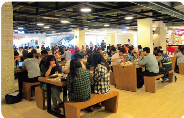
Shiny and Comfortable Park17 at the TSP after Renovation