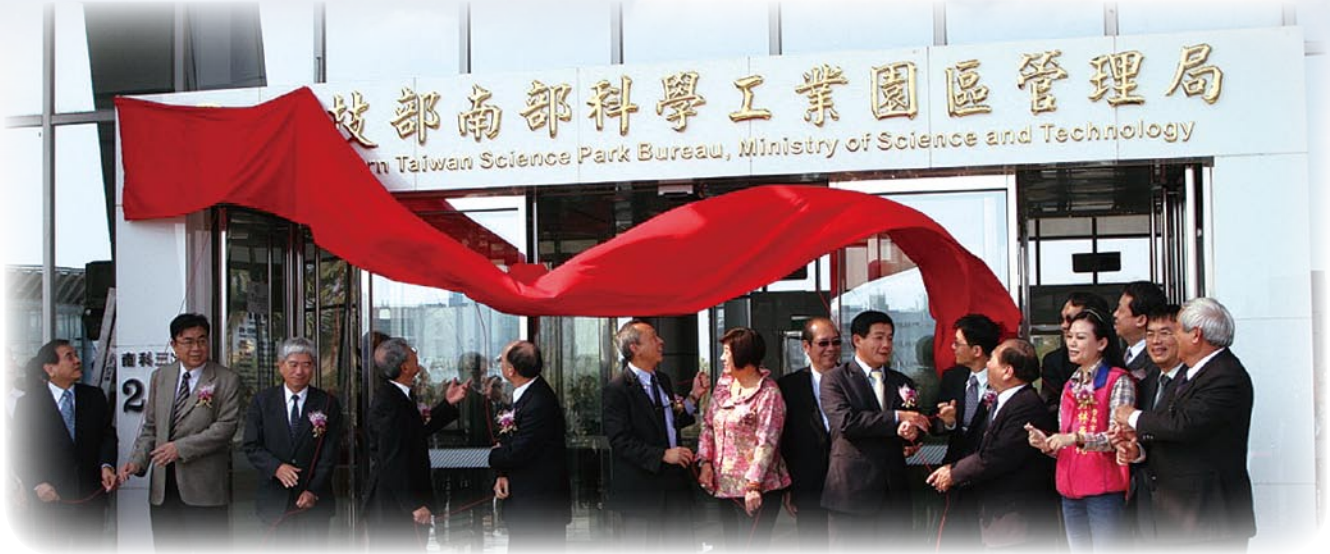
■ The Commencement Ceremony of Southern Taiwan Science Park Bureau of Ministry of Science and Technology (March 5, 2014)