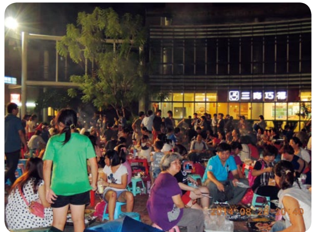
The B.B.Q. Event at Night at Life Hub of the TSP (August 28, 2014)