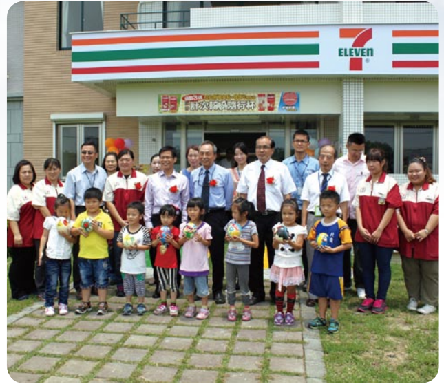
■ Opening of 7-ELEVEN at the KSP (June 11, 2014)

September 20 marked the beginning of Month of Promoting Occupational Safety and Environmental Protection with the commencement ceremony held at the Wellness Center of the TSP. Besides activities that promoted parent-children health and environmental education, several seminars, forum, the drill exercises of Joint Emergency Response Organization at different sites and for large-scale emergencies were also organized to build a safe, healthy, and environmentally-friendly sustainable environment at the STSP. On October 30, the award ceremony for outstanding enterprises and personnel with excellent performance in occupational safety and health, environmental protection was held with the participation of 300 attendees.