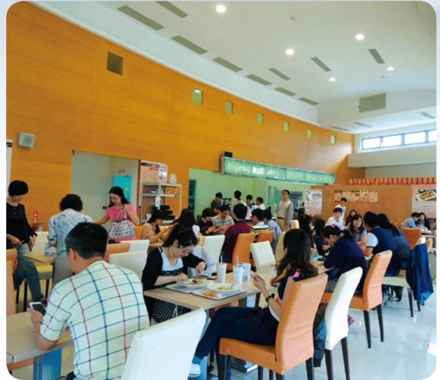
Introduction of Yidolar Restaurant at the Life Hub of the TSP (November 26, 2014)

In December, 2014, the renovation of Park17 was completed. By adding a public seating area and a nursery room, more comprehensive services were offered to the STSP employees and customers. The newly opened restaurants including Licha Tea House, Lavender, and ibo combined style and creative dining provide diverse Taiwanese, Japanese, and Thai cuisines.