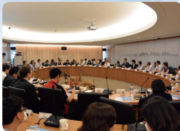
■ Commencement of Venture Capital Matching Seminar (May 27, 2014)

On June 5 and November 15 respectively, two activities including a swimming competition and a fun activity as well as "Lurkers' Mission Top Secret" were organized at the Wellness Center of the TSP. These two activities were highly praised by the participants. The Center will continuously provide sound sports service functions for the STSP employees and nearby residents.