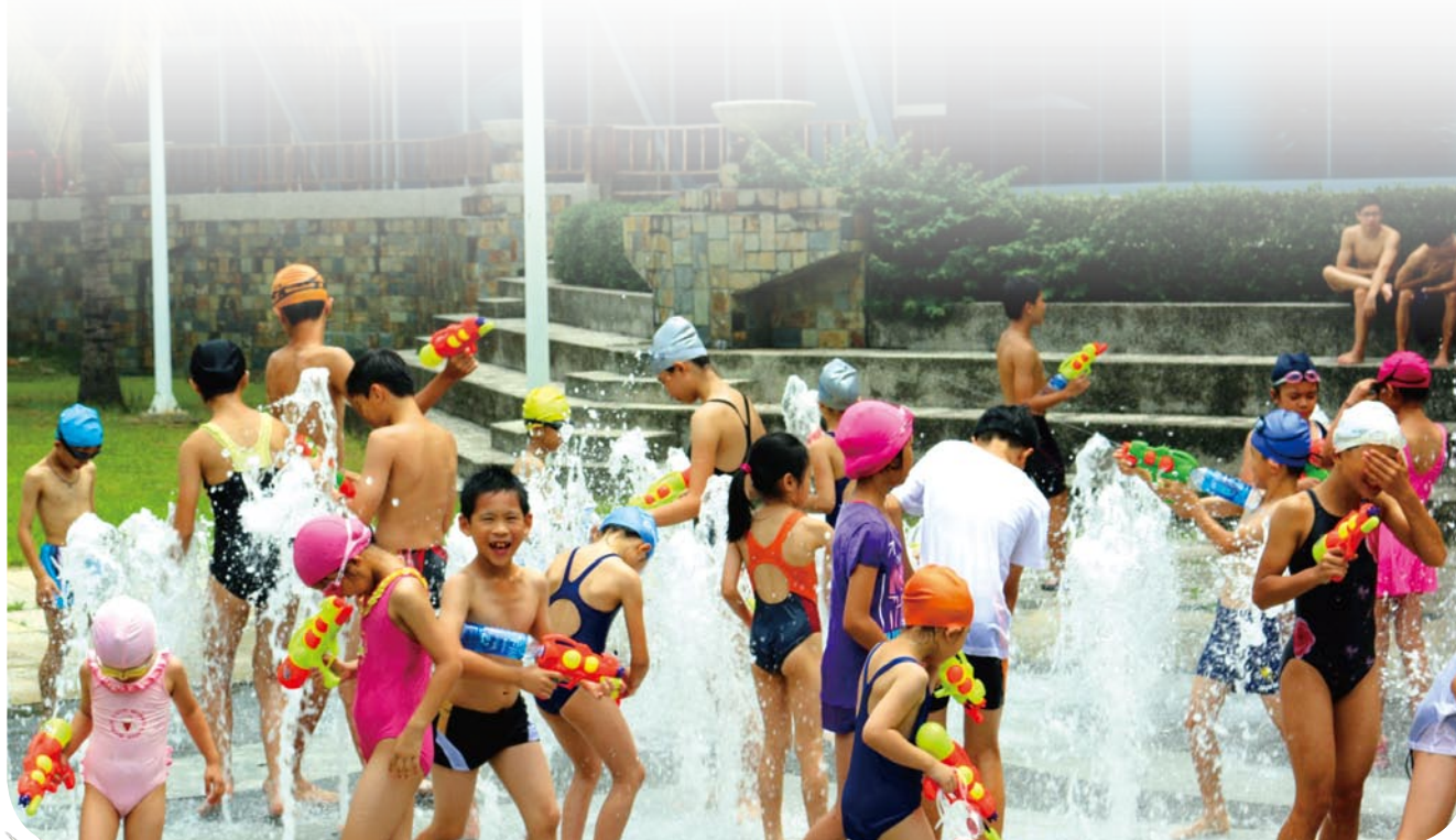
■ The Swimming Competition and Fun Activity at the Wellness Center of the TSP (June 5, 2014)