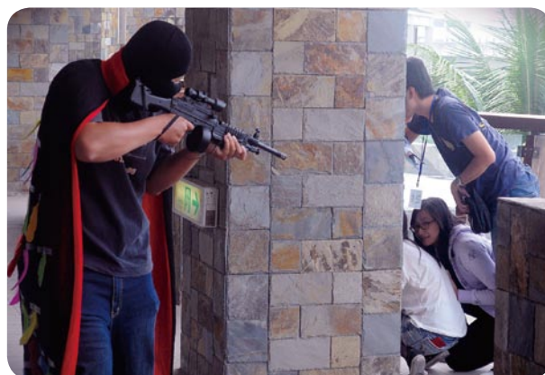
■ "Lurkers' Mission Top Secret" at the STSP (November 15, 2014)