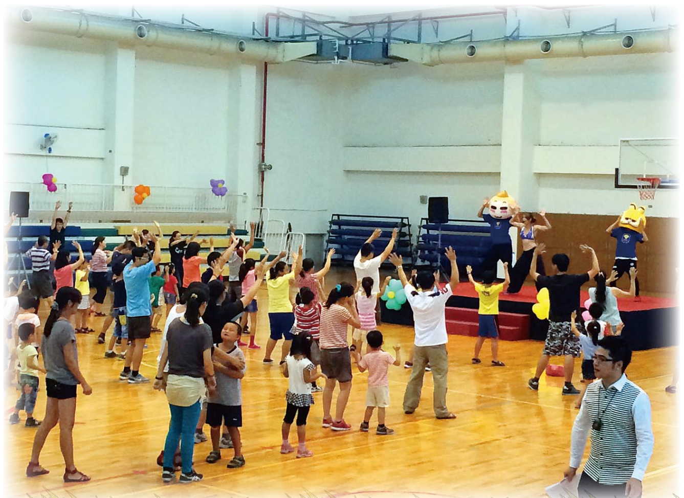
■ Month of Promoting Occupational Safety and Parent-Children Health Promotion and Environmental Protection Events (September 20, 2014)