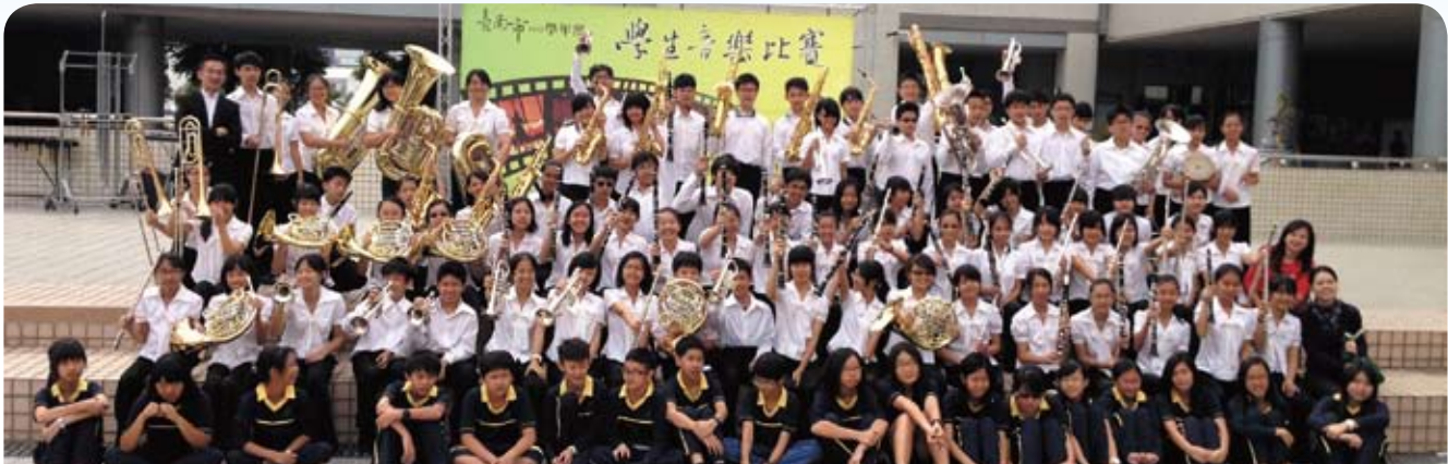
In the Southern Taiwan Final of National Students Music Contest, the Concert Band of the Elementary Department of the NNNKIEH was Awarded with the 1 st Place for Advanced Honors of Instrumental Ensemble Group B (March 15,2013)