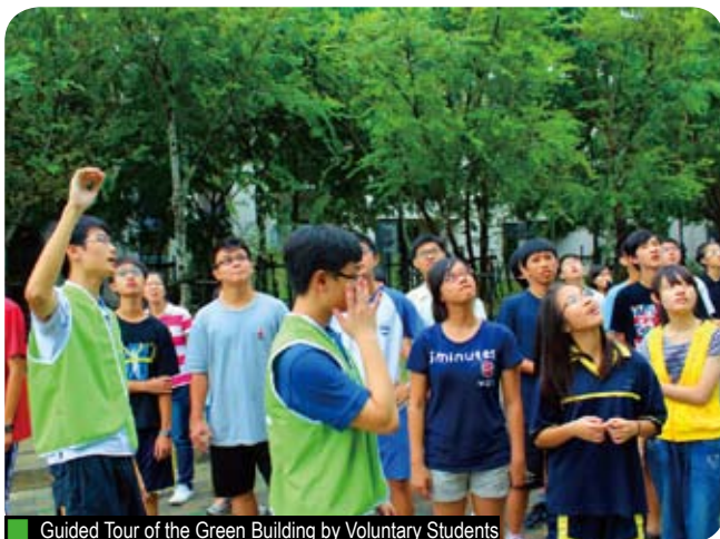
Guided Tour of the Green Building by Voluntary Students