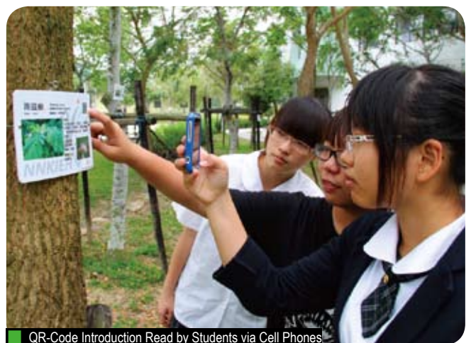
QR-Code Introduction Read by Students via Cell Phones