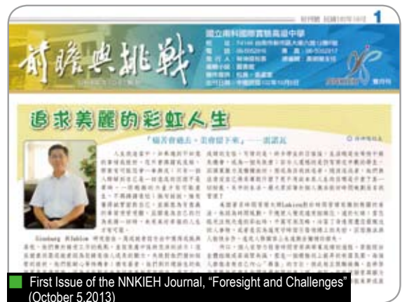
First Issue of the NNNKIEH Journal, “Foresight and Challenges” (October 5,2013)

The year 2013 marked the 8 th anniversary of the NNNKIEH, and in order to document the valuable records of students, the NNNKIEH library decided to publish the school journal, “Foresight and Challenge”. There are eight sections in the journal, published bi-monthly with a volume of 1,000 copies. The first issue was successfully published on October 5, writing an important page in NNNKIEH’s history.