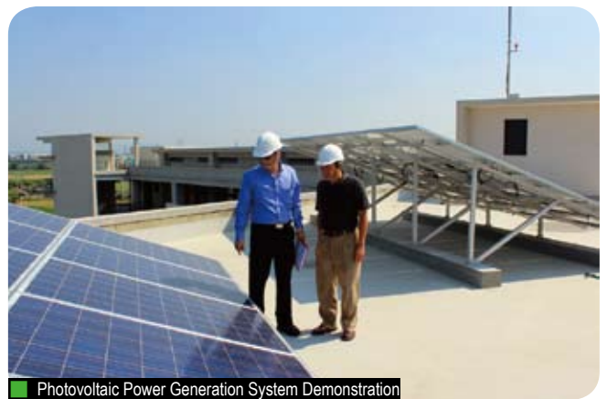
Photovoltaic Power Generation System Demonstration