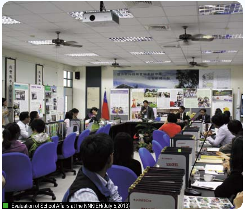
Evaluation of School Affairs at the NNKIEH (July 5, 2013)

The NNKIEH, on July 5, was evaluated by the Ministry of Education in School Year 2012 as first class (High Distinction) for school affairs administration among national public and private high schools. Among the seven evaluation criteria, the NNKIEH was evaluated as first class (High Distinction) for six including the leadership of the president, school affairs administration, student affairs counseling, environment and equipment, interaction of social groups, and performance. These achievements made the NNKIEH outperform all of its counterpart schools in southern Taiwan. Among the outcome, the members of the evaluation committee highly recognized the establishment of the NNKIEH based on “12-Year Model School for Future Integrative Green Technology” as well as the cooperative “Foresight Project” with I-Shou University.