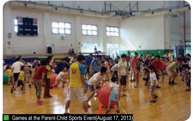
Games at the Parent-Child Sports Event(August 17, 2013)