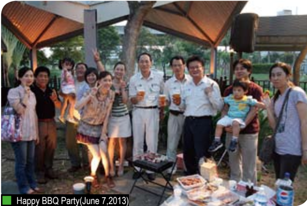
Happy BBQ Party(June 7,2013)

Originally operated by Leader, the Wellness Center, since January 1, has been managed by the STSPB. Various activities (BBQ party, Parent-Child Sports Event to Celebrate Childhood) were organized. The service quality has been continuously improved and it continues to encourage participation in physical fitness activities.