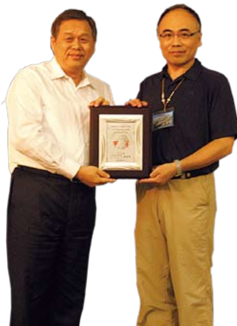
STSPB Certified as Level "A" Labor Inspection Agency Seven Years in a Row (November 12, 2013)

The STSPB has been devoted to disaster mitigation projects in order to completely control and manage its high risk sites with the aim of effectively reducing potential risks and enhancing overall labor safety standards. The STSPB was the only agency that was certified as Level "A" between 2006 and 2012 among all Science Parks and Export Processing Zones of the Ministry of Economic Affairs for seven years in a row by the Ministry of Labor (the former Council of Labor Affairs).