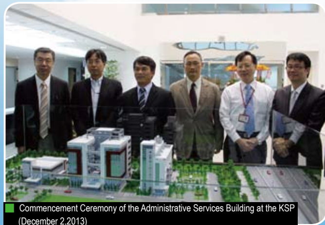
Commencement Ceremony of the Administrative Services Building at the KSP (December 2, 2013)

The Administrative Services Building was designed with a bamboo style and incorporated with solar powered LED lights that project different colors at night to present images with the themes of science and technology and environmental protection. The building was certified as a "Diamond-Rated Green Building Candidate"; it was expected to be the 11 th Diamond-Rated Green Building of the STSP.