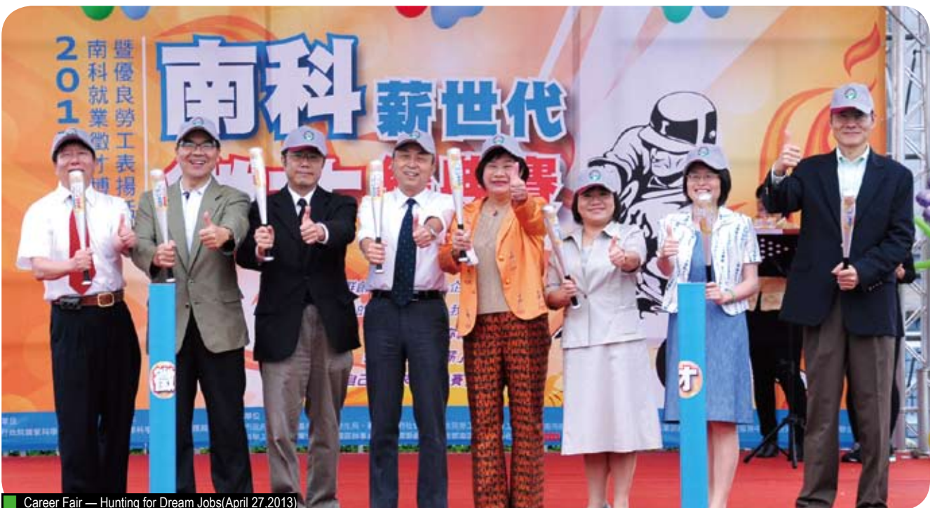
Career Fair — Hunting for Dream Jobs(April 27,2013)

On April 27, at Siraya Plaza, the “2013 STSP Career Fair and Outstanding Labor Awards” were organized with the participation of 40 Park enterprises and 3,000 job hunters. The initial matching rate reached approximately 80%. On the same day, 52 outstanding labors from various enterprises presented with awards.