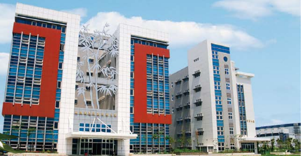
The Administrative Services Building at the KSP