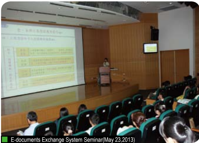
E-documents Exchange System Seminar(May 23, 2013)