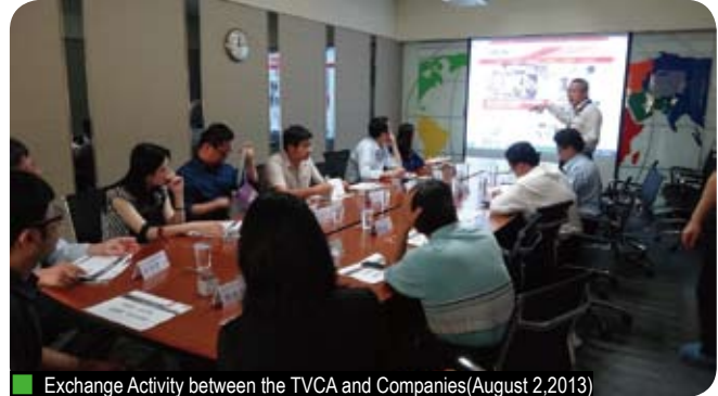
Exchange Activity between the TVCA and Companies(August 2, 2013)