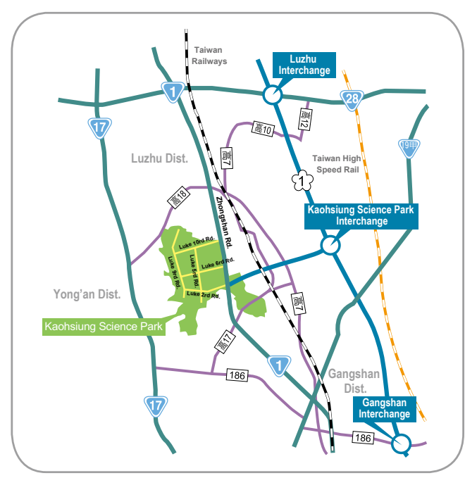
Traffic Map of the Kaohsiung Science Park(the KSP)

The Southern Taiwan Science Park(STSP) consists of the Tainan Science Park and the Kaohsiung Science Park. It was built as part of the "New Establishment of Science Parks" program of the "6-year National Development Project" proposed by the Executive Yuan in 1991. In 1993, an "Economic Revitalization Project" was approved and the proposal to "Establish the Southern Taiwan Science Park" was initiated. In May 1995, the STSP Development Plan (Phase I Site of the Tainan Science Park) was ratified, making a major stride in the development of the high-tech industry in Southern Taiwan. In April and September 2001, the development of the Luzhu Science Park (now the Kaohsiung Science Park) and Phase II site of the Tainan Science Park were ratified, respectively.