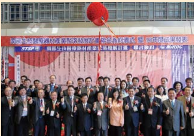
Joint Signing Ceremony of Southern Taiwan Biomedical Device Industrial Cluster Development Plan and 2009 Achievement Presentation (February 24, 2009)