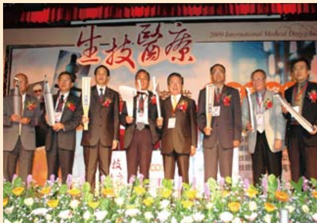
Distinguished Guests in International Conference on "Southern Taiwan Biomedical Device Industrial Cluster Development Plan" (November 3, 2009)