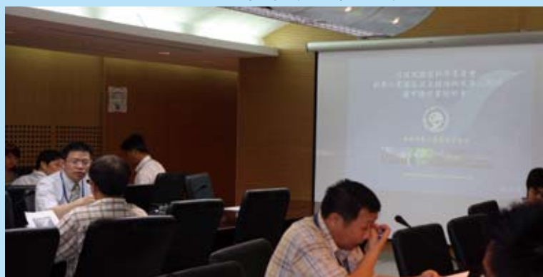
Seminar on Phase II Planning and Execution of Strengthening and Improving Program (January 15, 2009)