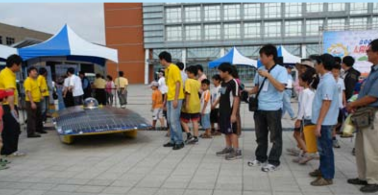
STSP Solar-powered Amphicar Family Camp (October 24, 2009)