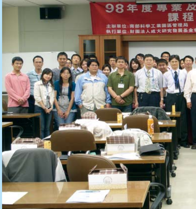
2009 Professional and Technical Talent Training Project (February 12, 2009)