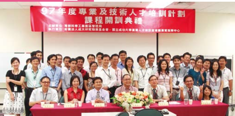
▲The inauguration of the 2008 Professional and Technical Talent Training

Through ingenuity and dedication, the STSP Administration facilitated industry-academia collaboration on environmental protection and occupational safety management by inviting Park enterprises managers to speak at local colleges. Teamed with the Department of Environmental Engineering of National Cheng Kung University, the establishment of the "High-tech Industry and Environmental Protection" lecture helped raise student awareness on practical occupational safety. Moreover, "High-tech Industry and Safety and Health" course was added in 2008. This course invited Park enterprise managers to discuss the environmental practice regarding the Park's environmental protection system, bio-pharmaceuticals, optoelectronics, and IC industries. This allowed the various enterprises to share their experiences in industry environmental protection practice and execute the educational concept of "Last Mile."