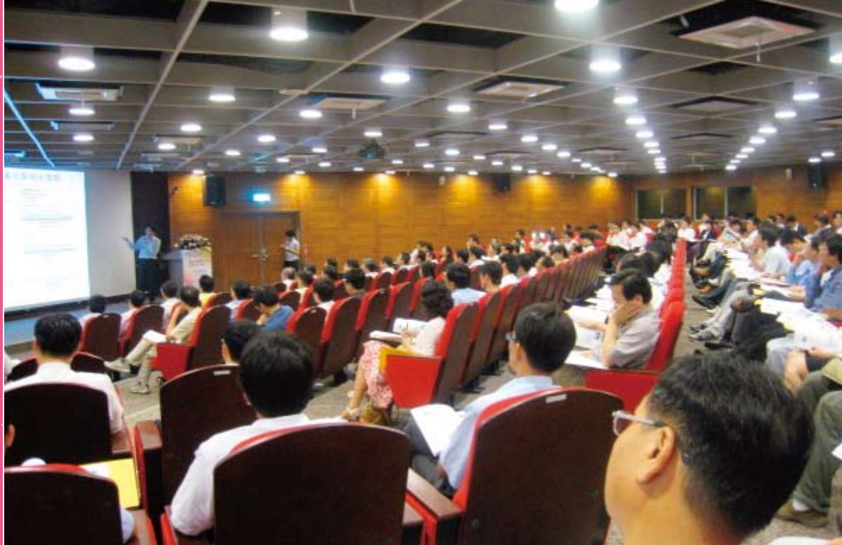
▲Many attendees in the Advanced Technology Seminar