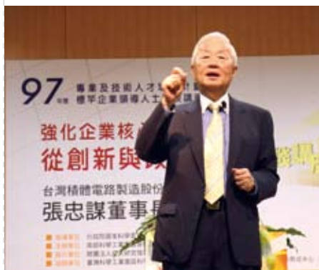
▲ Dr. Morris Chang, Chairman of the TSMC, lecture on "Reinforcing Core Competence"

To pool technical knowledge of the STSP's biotechnology enterprises and their peers while strengthening biotechnology industry's corporation and academia collaboration platform, the STSP Administration hosted the STSP's Biotechnology Enterprises Convention in April and September of 2008. Management from industry, government, and academia were invited to share their industry outlook and managerial experiences in hope for better collaborations between them.