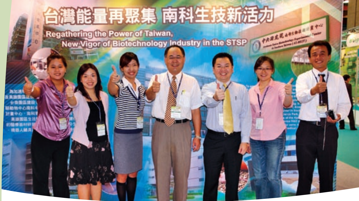
At the 5th Annual Bio Taiwan Expo (Jul. 26)