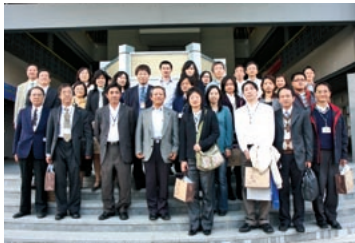
The STSP Elite Experience company recruitment event (Dec. 6)