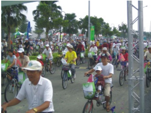
Participants on the Day of Commencement Ceremony of Bikeway (October 8)