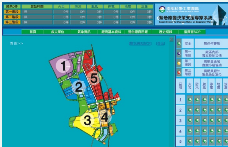
Expert Supporting System of Emergency Response Decision-making

No damage incidents were reported during the flooding period from June 12 to 16, 2005. The Emergency Response Mechanism was activated to dispatch needed personnel and equipment for rescue duties and to mitigate damage of injuries and property loss of the explosion incident of Motech Industries Inc. on November 23, 2005 and the quick response and effective work has been highly recognized.